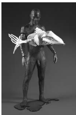
Simon Gilby Finalist 2009 The Syndicate touring exhibition